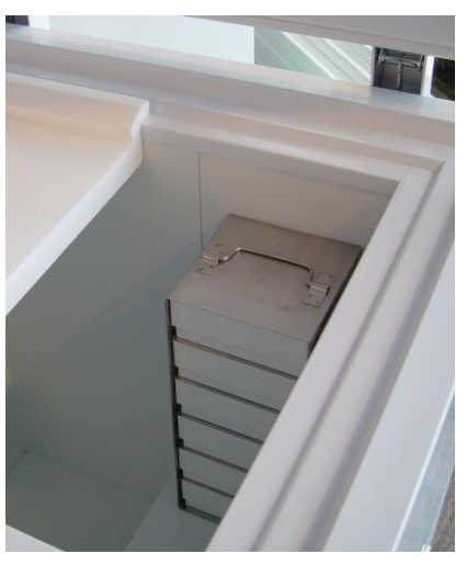
Inner lids (left hand side) which are mandatory for optimized function